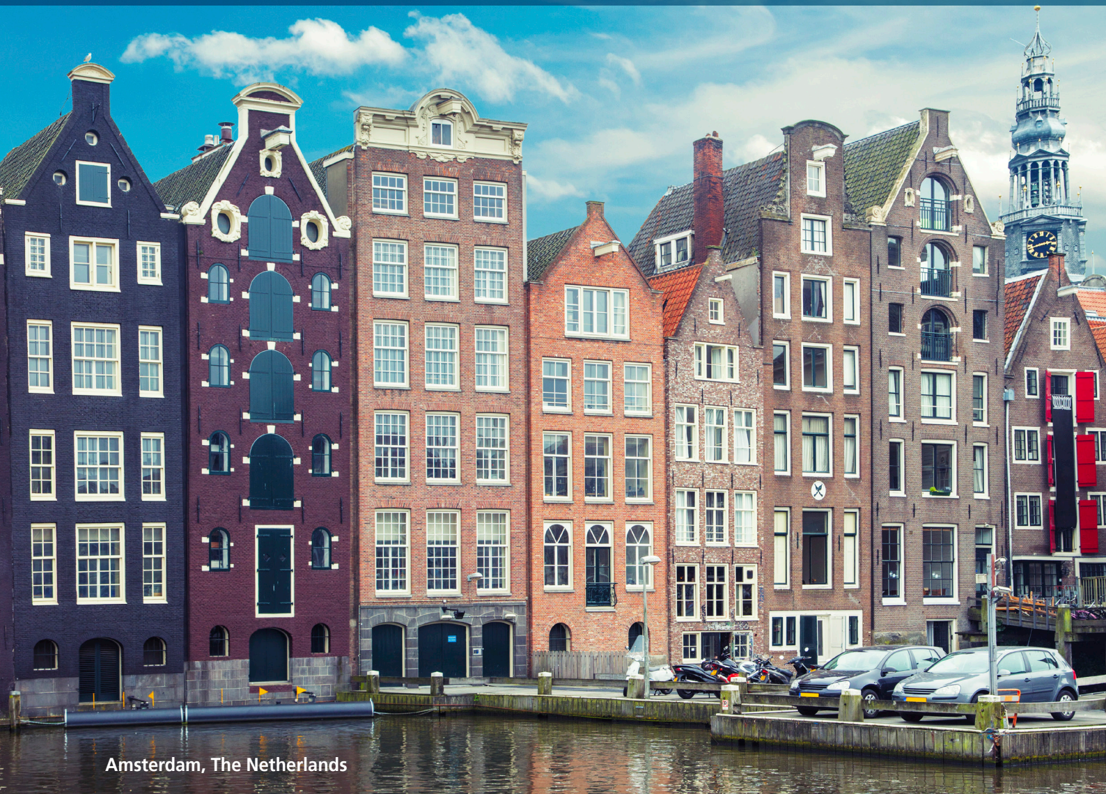
Amsterdam, The Netherlands