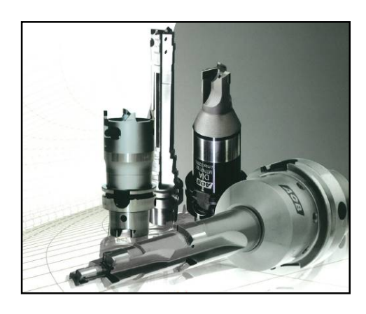
Products from AOB's range