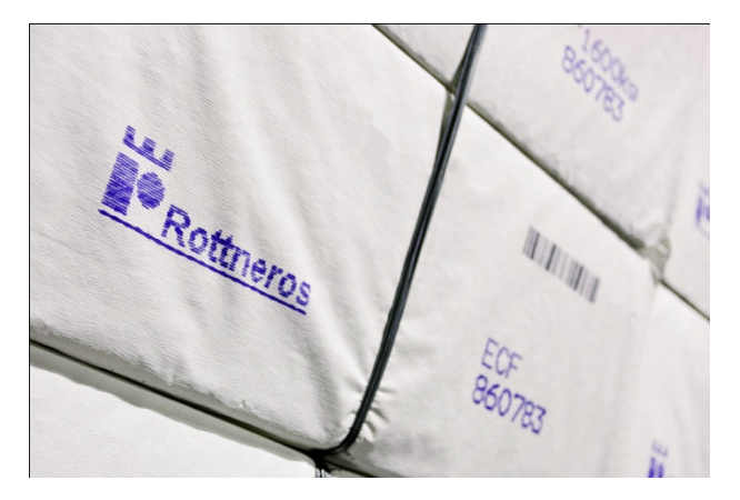
Pulp bales produced at Vallvik Mill