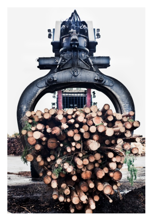
Wood processing at Vallvik Mill.