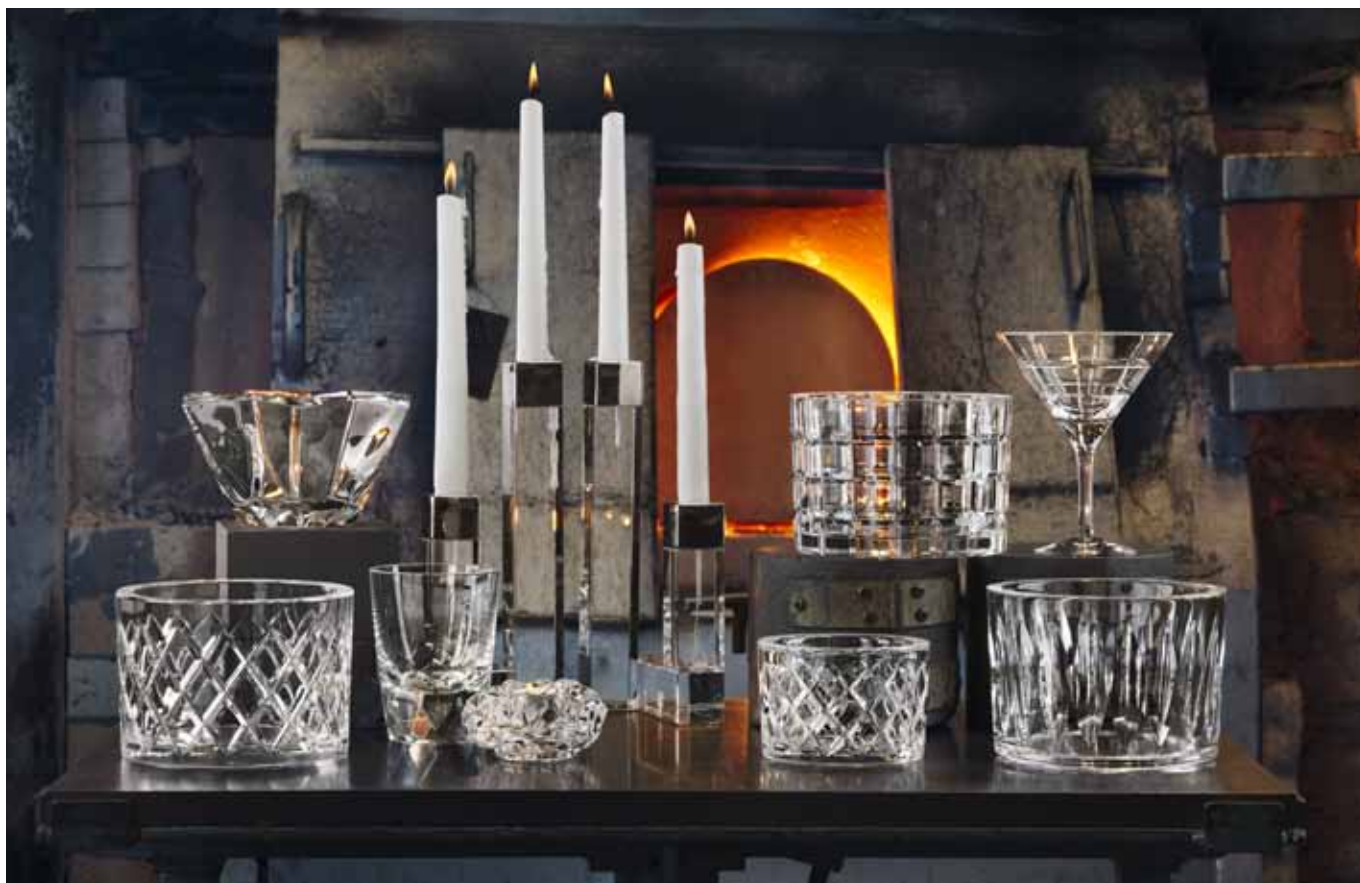
Crystal from Orrefors

economic situation we see no possibility of reaching an acceptable profitability in the foreseeable future, without sweeping and drastic changes. The strong Swedish Krona has also made it difficult for OKB's export.