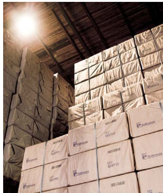
The pulp stock at Vallvik Mill