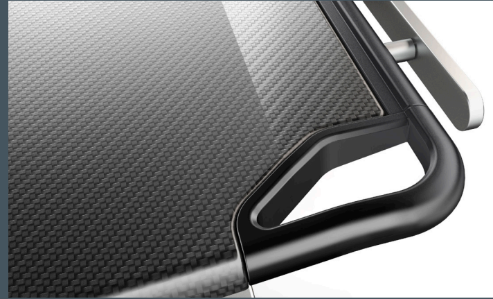
0.4 mm Aluminum Equivalency