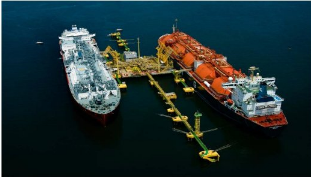
Golar Spirit FSRU receiving cargo from LNG Carrier in Guanabara Bay, Rio de Janeiro

and time have become the main drivers behind the growing interest in the various types of floating LNG regasification projects. FSRUs projects can typically be completed in less time (2 to 3 years compared to 4 or more years for land based projects) and at a significantly lower cost (20-50% less) than land based alternatives.