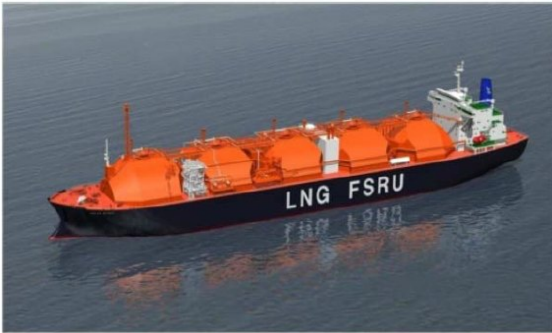
Artist's Rendition of Golar Spirit FSRU located in Brazil.

The FSRU regasification process involves the vaporization of LNG and injection of the natural gas directly into a pipeline. In order to regasify LNG, FSRUs are equipped with vaporizer systems that can operate in the open-loop mode, the closed-loop mode or in both modes. In the open-loop mode, seawater is pumped through the system to provide the heat necessary to convert the LNG to the vapor phase. In the closed-loop system, a natural gas-fired boiler is used to heat water circulated in a closed-loop through the vaporizer and a steam heater to convert the LNG to the vapor phase. In general, FSRUs can be divided into four subcategories: