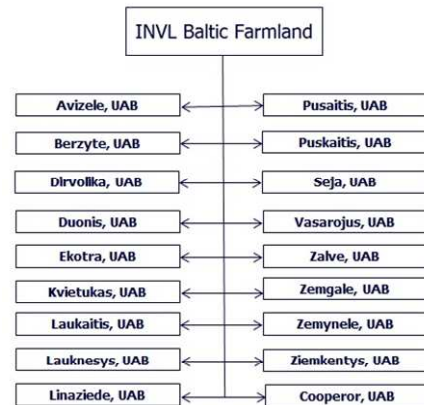
Group structure of INVL Baltic Farmland, AB

INVL Baltic Farmland, AB later will apply to the Bank of Lithuania for closed-end investment company license and in its essence will become similar to investment fund.