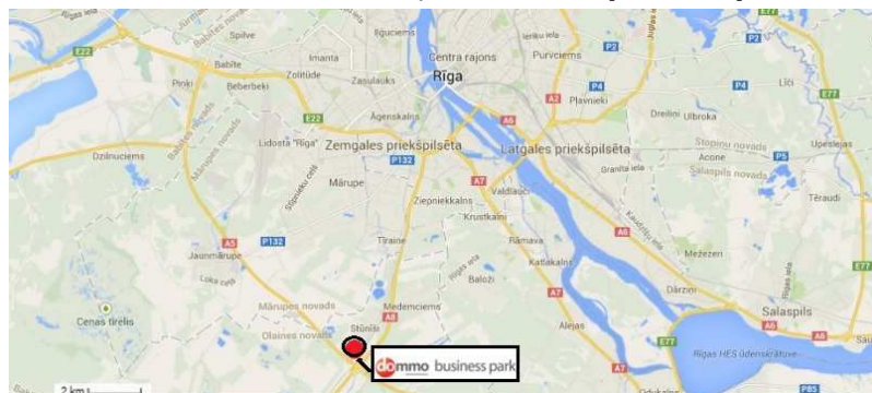
Real estate objects owned by group companies of INVL Baltic Real Estate, AB in Riga (Latvia)