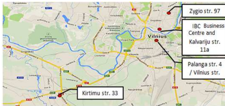
Real estate objects owned by group companies of INVL Baltic Real Estate, AB in Vilnius (Lithuania)