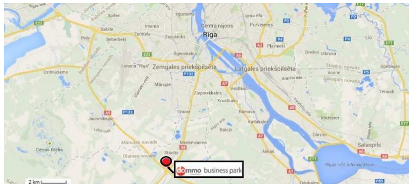
Real estate objects owned by group companies of INVL Baltic Real Estate, AB in Riga (Latvia)