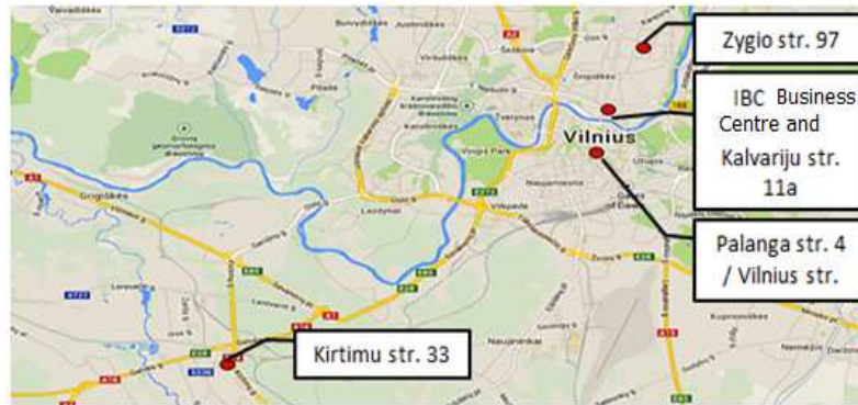
Real estate objects owned by group companies of INVL Baltic Real Estate, AB in Vilnius (Lithuania)