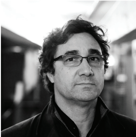
Alfredo Brillembourg Founder of Urban-Think Tank (U-TT)