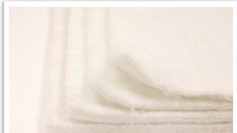
Needled, Stitch-bonded mats