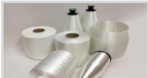
Single, Textured yarns