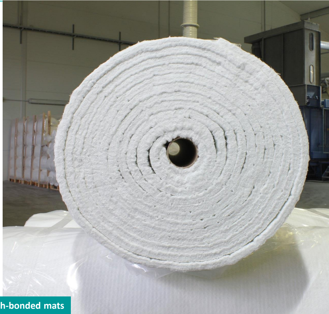
Needled, Stitch-bonded mats