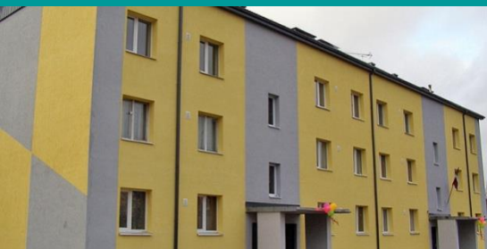
Building, renovation, architecture