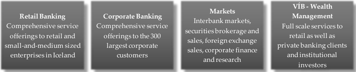
Figure 1: Issuer’s business lines