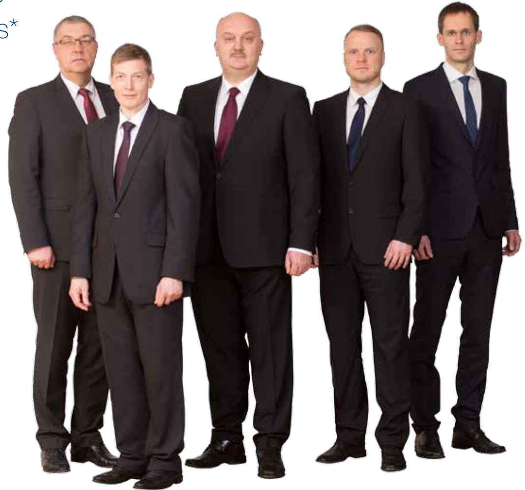
Management Board of Latvenergo AS