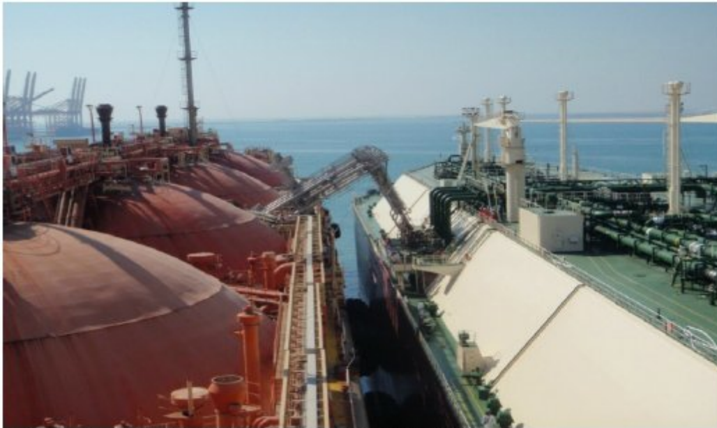
Golar FSRU, Golar Freeze, receiving cargo from Qatargas LNG Carrier in Dubai