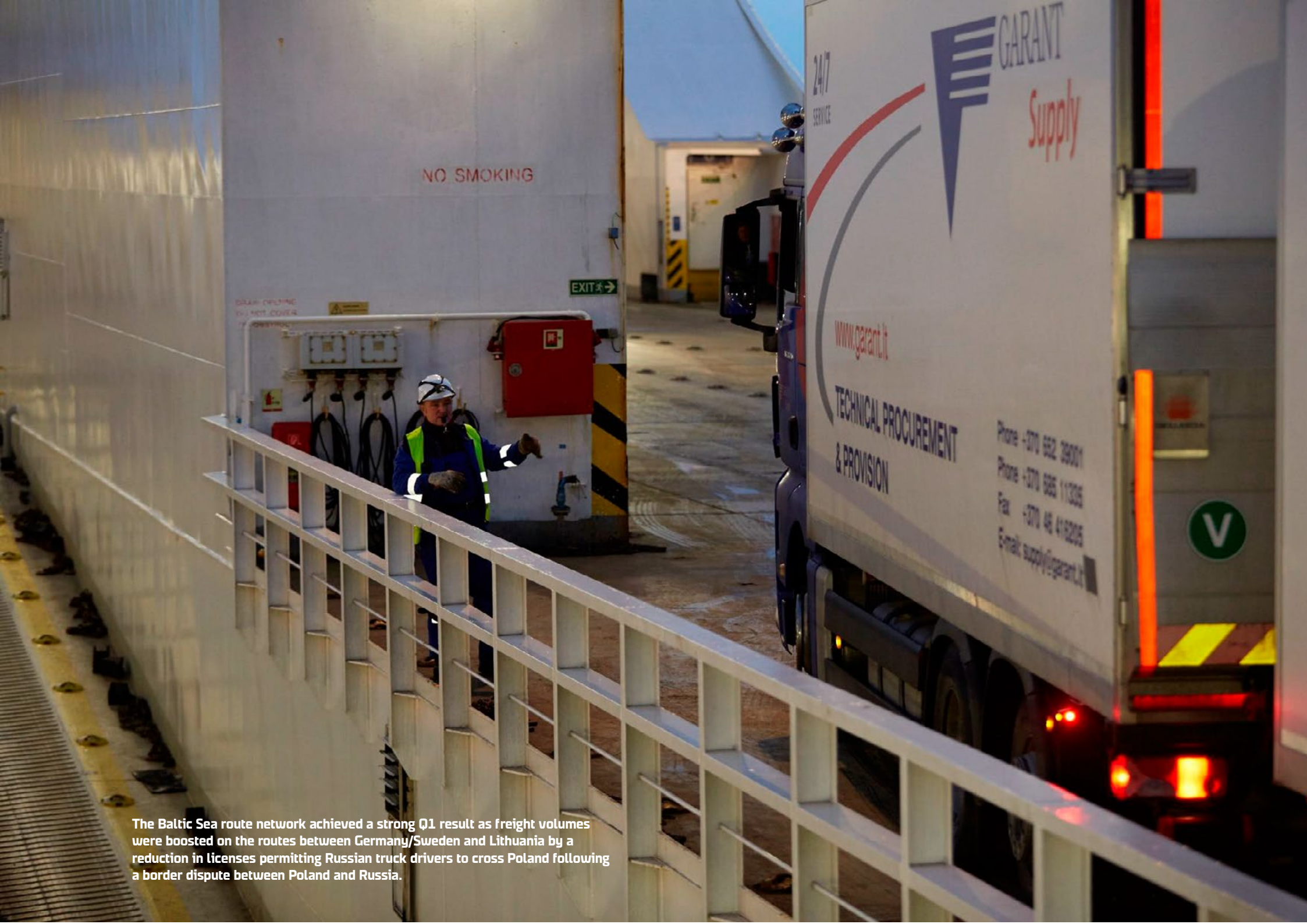
The Baltic Sea route network achieved a strong Q1 result as freight volumes were boosted on the routes between Germany/Sweden and Lithuania by a reduction in licenses permitting Russian truck drivers to cross Poland following a border dispute between Poland and Russia.