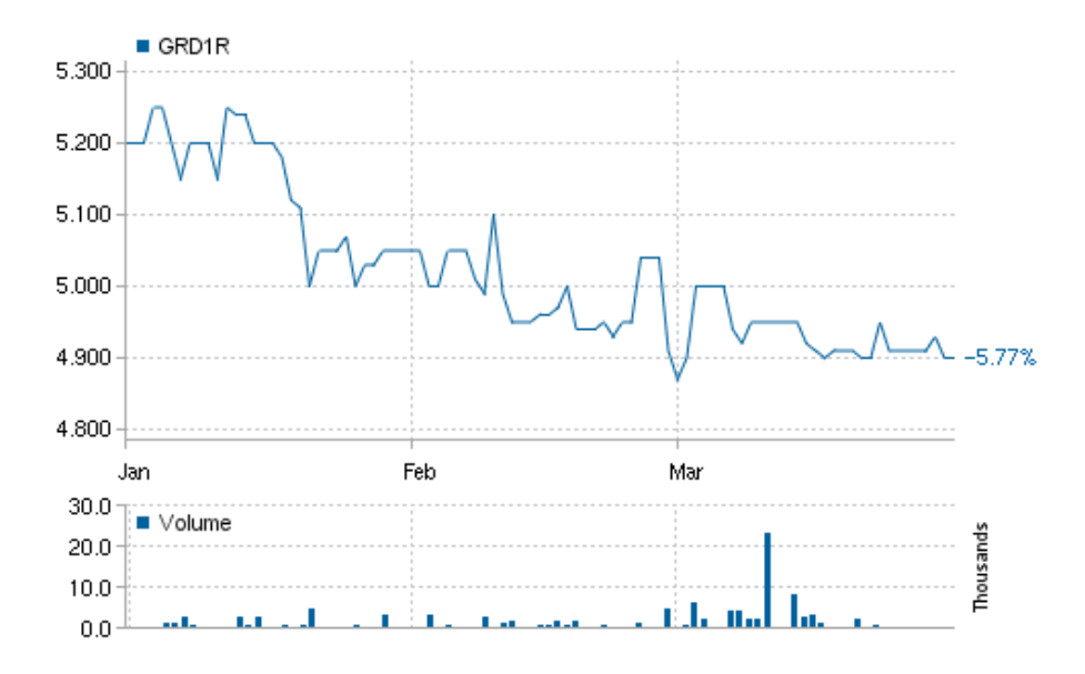
"Grindeks" share price development in the first quarter of 2016 in comparison with Baltic market indexes (data of NASDAQ Riga)

In the first quarter of 2016, the Group's earnings per share (EPS factor) was 0.01 euro in comparison to 0.15 euro in the first quarter of 2015.