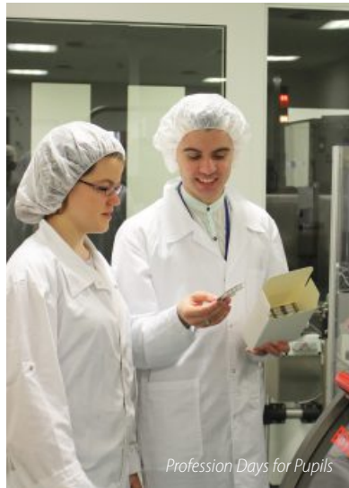
Profession Days for Pupils