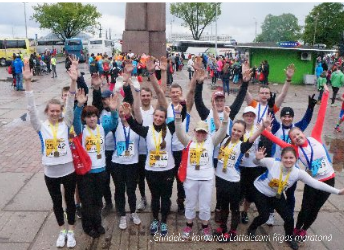
„Grindeks” komanda Lattelecom Rīgas maratona