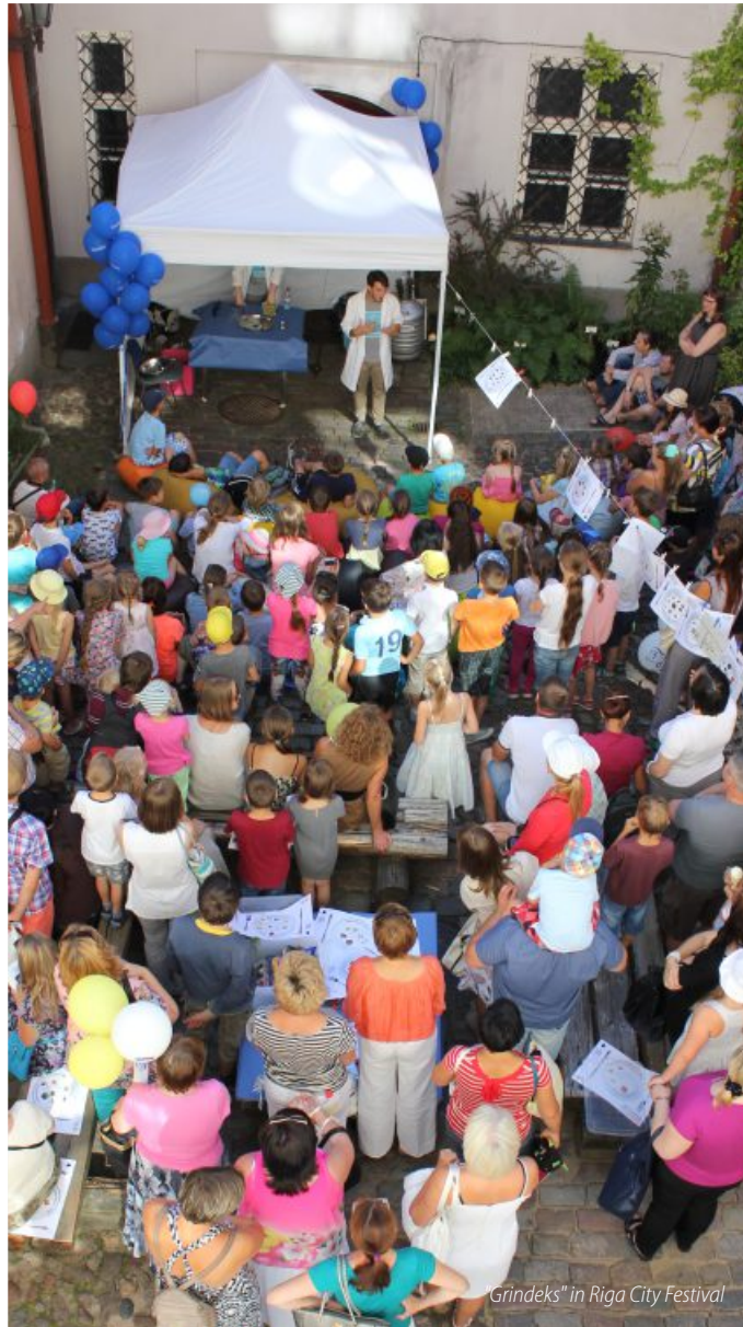
Grindeks" in Riga City Festival

The company annually provides a significant number of internship placements to support chemical and pharmaceutical students and young professionals, thus promoting professional growth and career development. In recent years, more than 600 young specialists have fulfilled their internships in "Grindeks", but in 2015 the company offered internship placements for 75 students from Latvia and abroad. In addition, in 2015, "Grindeks" also offered a paid internship positions. The company has signed a cooperation agreement with the Foundation "Riga Technical University Development Fund" for this purpose. During the internship, students were assigned various tasks according to specifics of respective position, as well as they gained practical knowledge from learning by doing. Paid internship positions for 6 months were acquired by 3 students of chemistry and pharmaceutical areas.