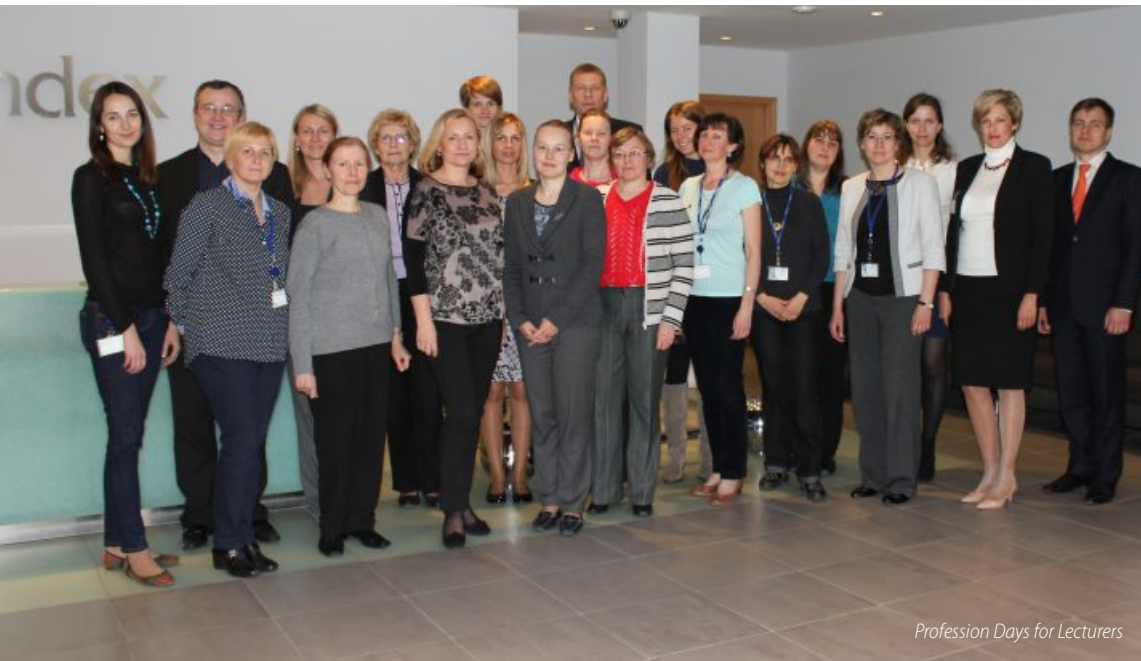
Profession Days for Lecturers

Basic directives of the “Grindeks” Fund “For the Support of Science and Education”, launched in 2016, are support to higher education institutions, support to secondary educational institutions and teachers, facilitating excellence, as well as the promotion of pharmaceutical and chemical industries.