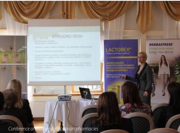
Conference of independent Latvian pharmacies