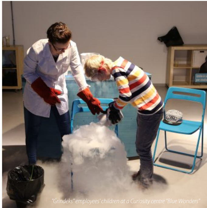
“Grindex” employees’ children at a Curiosity centre “Blue Wonders”