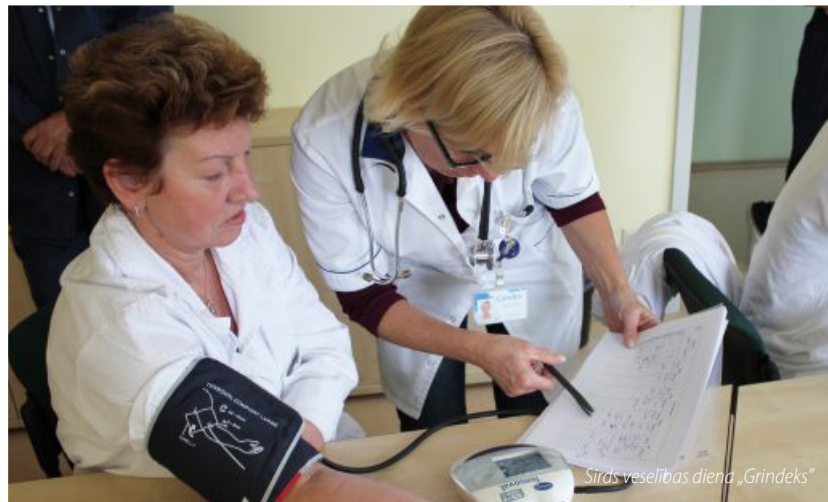
Sirds veselības diena „Grindeks”