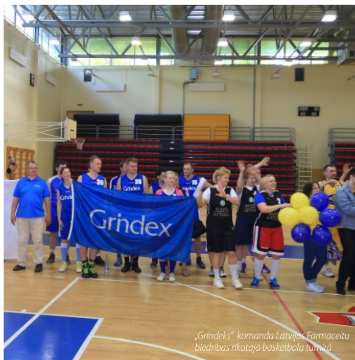
„Grindeks” komanda Latvijas Farmaceitu biedrības rīkotajā basketbola turnīrā

Team of “Grindeks” works unitedly not only at their workplace, but also outside work. Continuing the tradition established in 2014, the company’s employees, also in 2015, took part in the apple and pear picking, where they gathered 3 tons of fruit. The fruit obtained at the apple and pear picking were traditionally used as corporate Christmas gifts for clients and partners. Part of harvest picked in autumn was donated to low-income families in December.