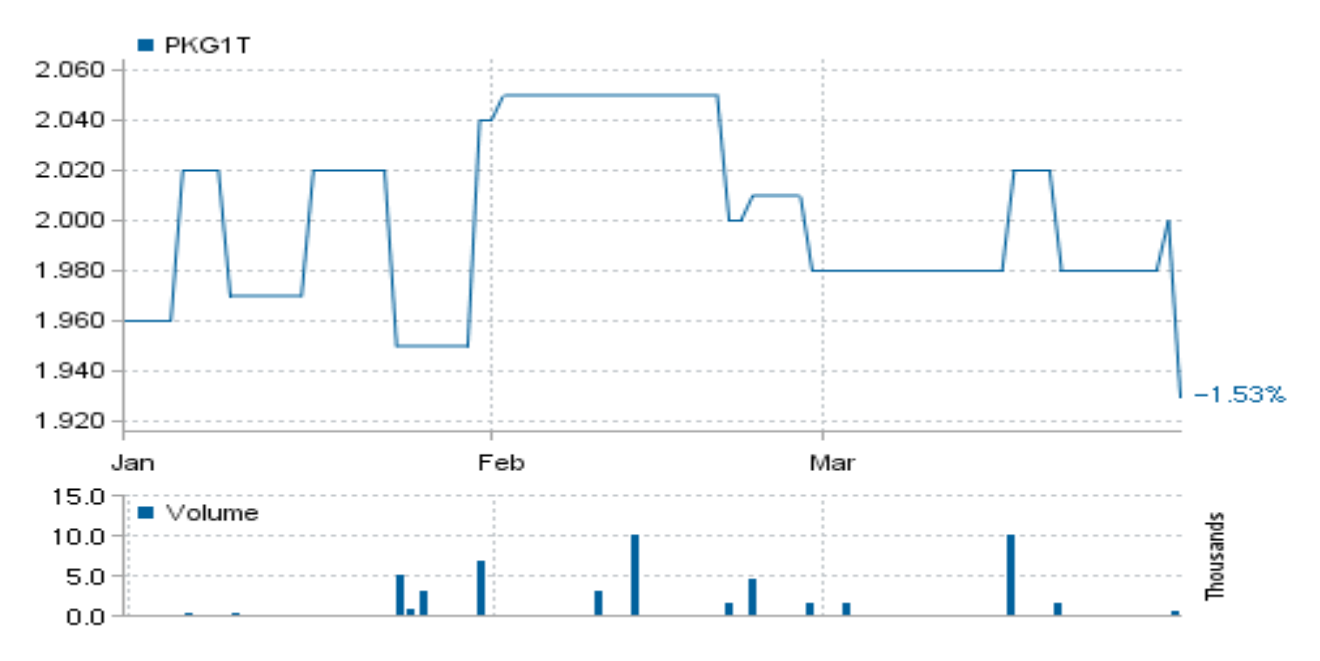
On 23 November 2012 the Company's shares started trading on the secondary list of Tallinn's stock exchange. During the reporting period 1 January – 31 March 2017 the shares were trading at the price range of 1,93 - 2,05