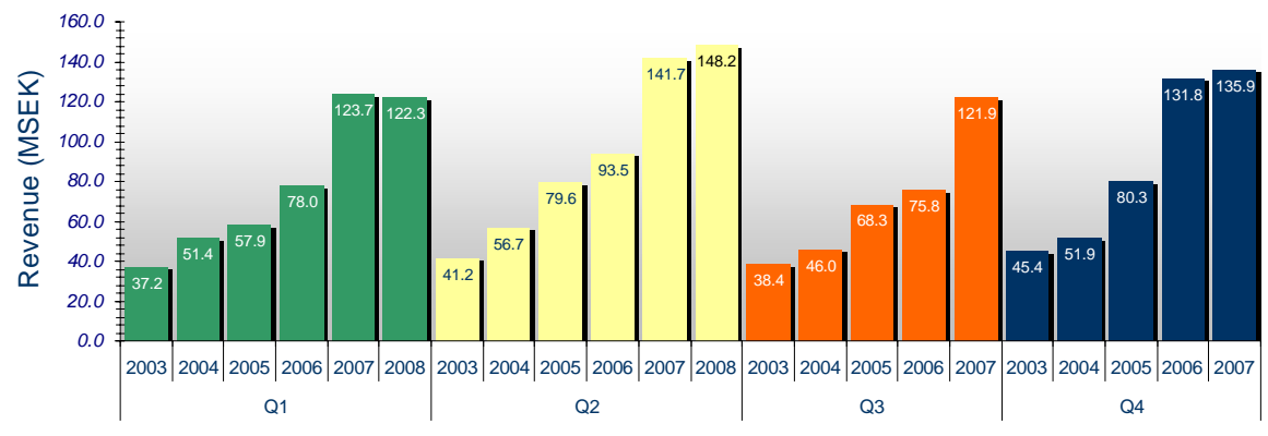
Revenue development by quarter

BTS' net turnover increased by 2 percent during the first half-year and amounted to MSEK 270.5 (265.4). Adjusted for changes in exchange rates, growth was 12 percent. Growth in local currency terms was strong in all units with the exception of APG: BTS North America grew by 22 percent, BTS Europe grew by 20 percent, BTS Other markets grew by 33 percent, while APG decreased by 12 percent.